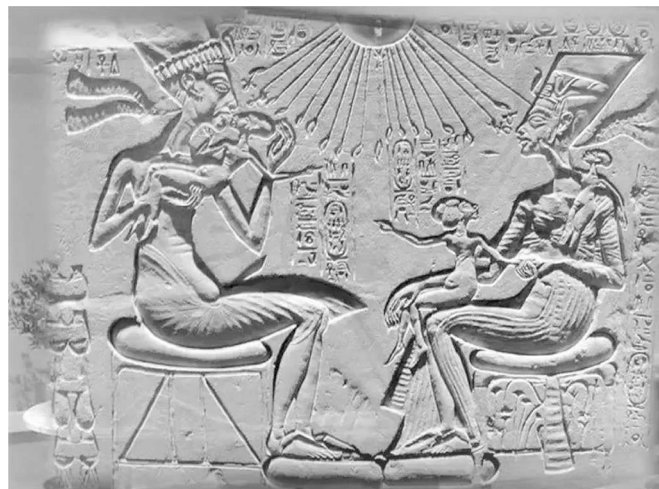
Fig. 1. An image showing Akhenaten, Nefertiti and three children exposing themselves and a house plant to the healing rays of sunlight. The religious symbols in the image suggest that the Ancient Egyptians venerated and worshipped the sun.

The Greeks and the Romans clearly recognized the healing power of the sun. They built solariums and sunbaths, and the Greeks even used them to enhance the strength of athletes preparing for the Olympic Games by exposing them to several months of sunlight treatment. The word, heliotherapy, actually derives from the Greek name for their sun god, “Helios”; heliotherapy meaning sunlight therapy [23–26]. Furthermore, Ayurvedic medical records show that as far back and 1400 BCE; Hindus used the combination of sunlight and photosensitive herbs, such as furocoumarins, to treat vitiligo and other conditions—a combined treatment, which many refer to today as photodynamic therapy [27]. Moreover, records indicate that heliotherapy was a